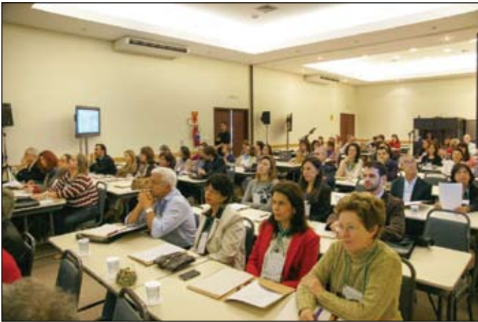
A view of the Meeting main room with representatives of every State Regional Neonatal Center, as well as representatives of Argentina, Bolivia and Chile.

D uring the Thyroid Awareness Week (May 25-27, 2012), an international meeting on Neonatal Screening for Congenital Hypothyroidism was organized by the "Instituto da Tiróide" at the Panamby Hotel, in São Paulo. Brazil has a centralized and well-organized national Screening Program for Neonatal Disorders (PNTN).