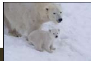
Mother and Child in Ranua Zoo