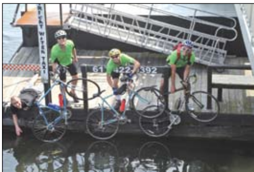
The riders kicked off the 2012 journey by dipping their bikes in the Atlantic Ocean at Christopher Columbus Waterfront Park in Boston, MA. At the conclusion of the journey in San Francisco, the team will dip their bikes in the Pacific Ocean!