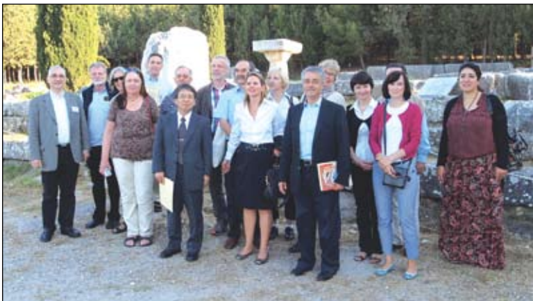
Participants of the conference in front of the ruins of Hippocrates' hospital