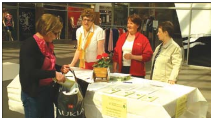
WTD at indoor market place in Vasa, Finland

The ETA press statements mention the International Thyroid Awareness Week, created by TFI.