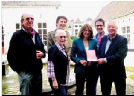
Board members and TFI representative receive booklet on Quality Criteria.

to the internist-endocrinologist for treatment.