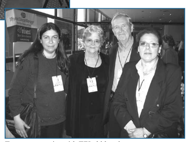
Two new recruits with TFI old hands.

ATA and LATS booths and the travel agency. We had many visitors, lots of interesting contacts, and were extremely busy all throughout the week! The contacts with the doctors and the local organizers were very good and the people from Lothse and Barcelo Vergerwere very helpful.